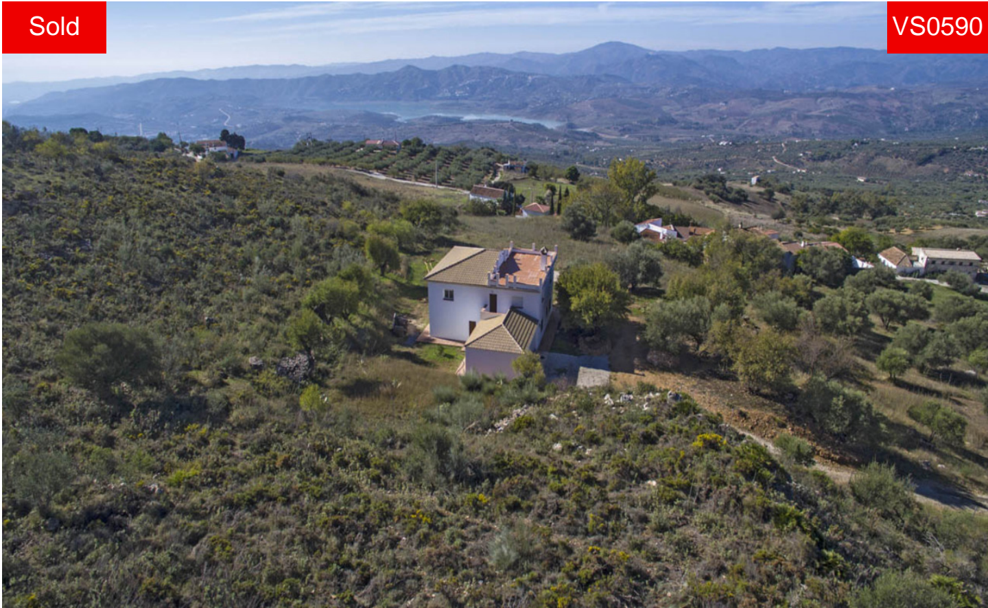
Villa in Vinuela