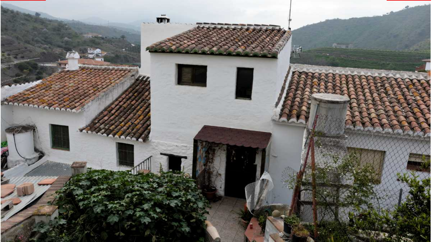
Village House in Vinuela