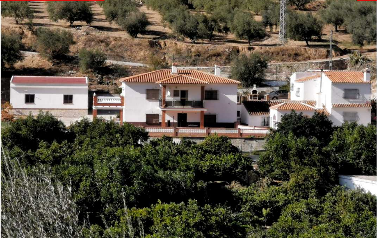
Villa in Alcaucin