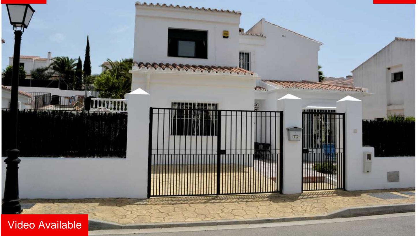
Villa in Puente don Manuel