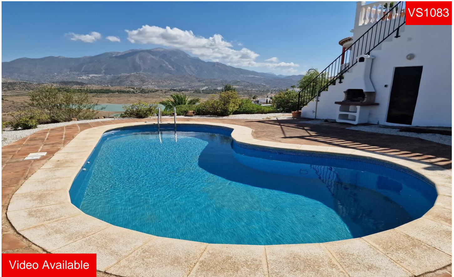
Villa in Vinuela