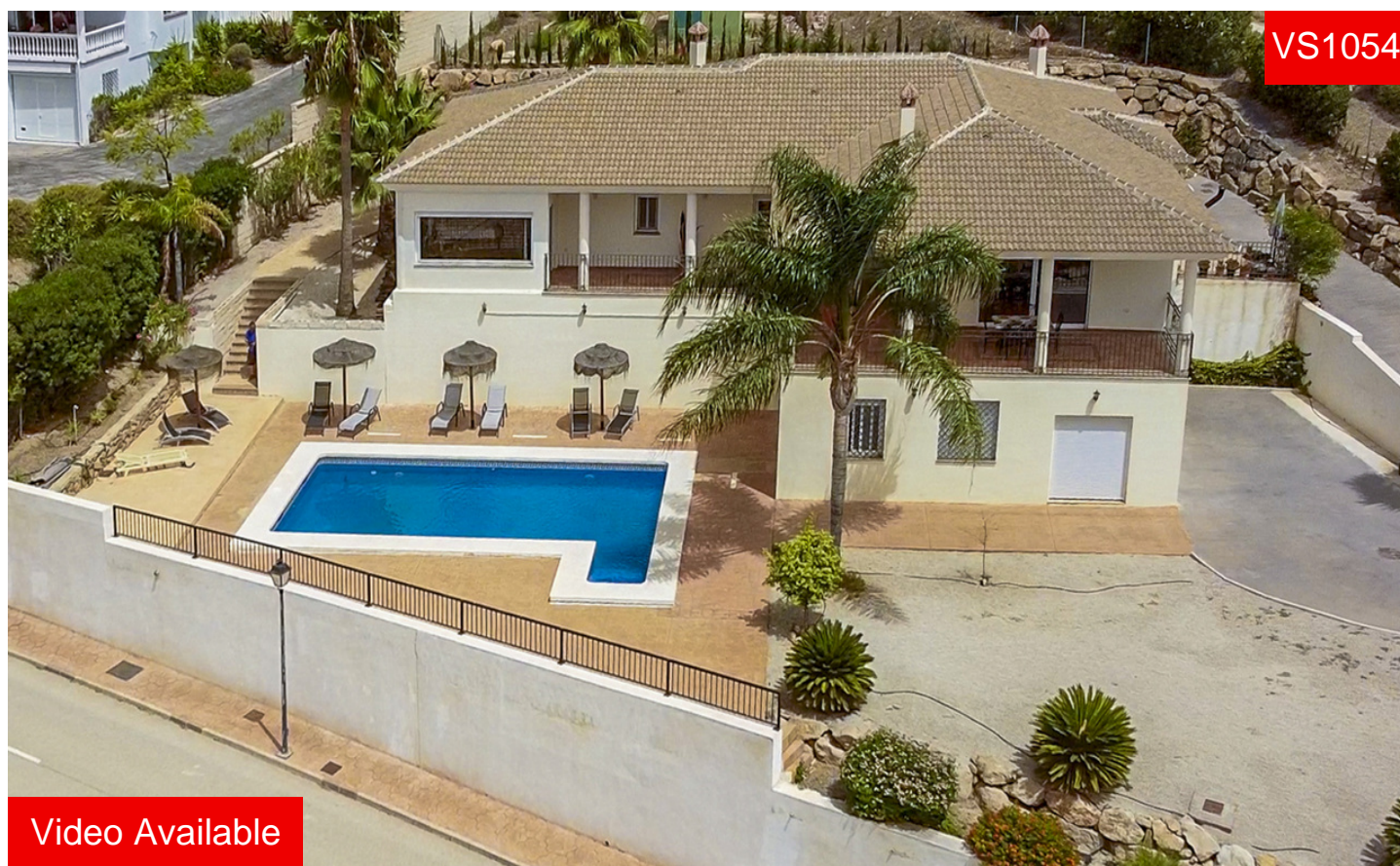
Villa in Periana