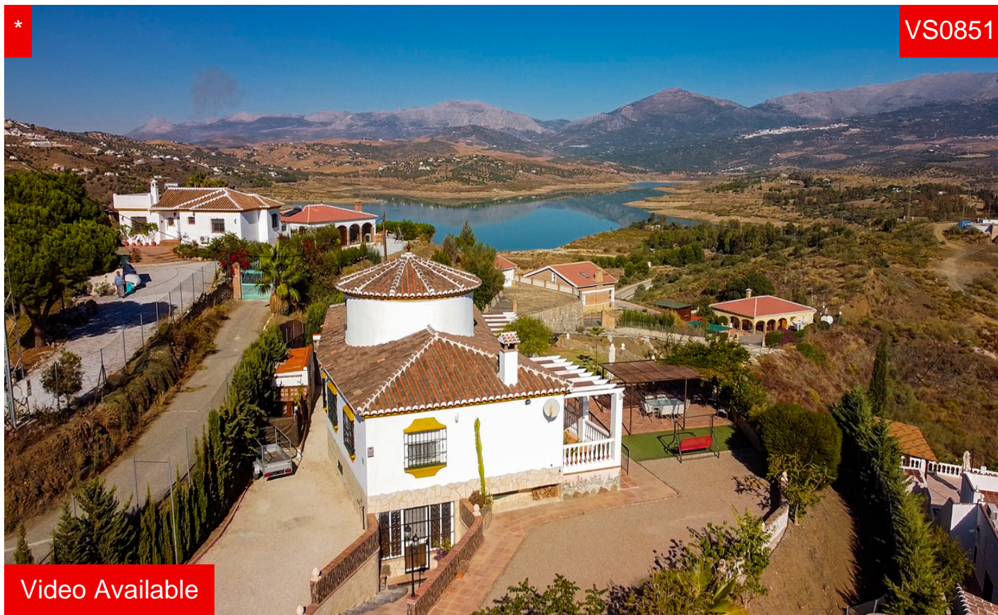
Villa in Vinuela